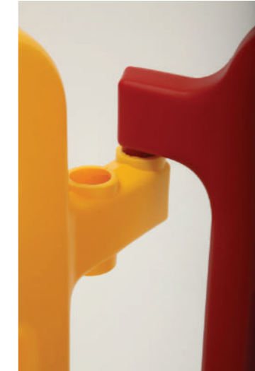
3-way connection, flags, or anchor to the ground.