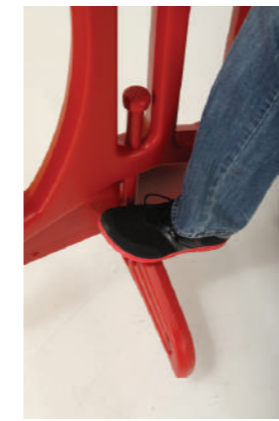
Legs fold flat...

Known as the "billboard" barricade. This quality crowd control barricade has many terrific features, including the ability to display graphics and signage via a highly visible (36"x28.5") advertising panel. The signs on the barricade are easy to change via four bolts to help save you time and money.